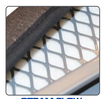
STEAM FLOW METAL MESH