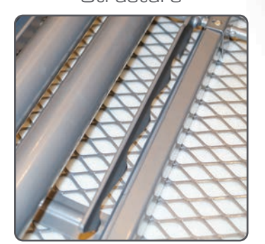
SUPER THICK Height Adjustment Rail