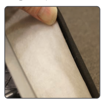
2MM FOAM & 5MM FELT Combination Padding