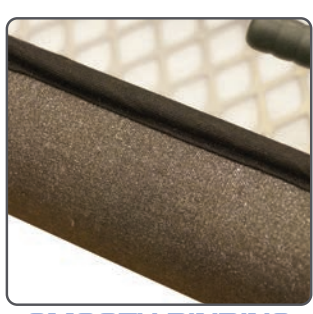
SMOOTH BINDING EDGES To Withstand Fraying