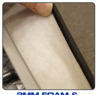
2MM FOAM & 5MM FELT Combination Padding