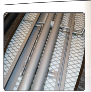
EXTRA THICK SUB-FRAME Structure