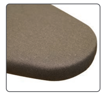
METALLIC HEAT REFLECTIVE Iron Board Cover