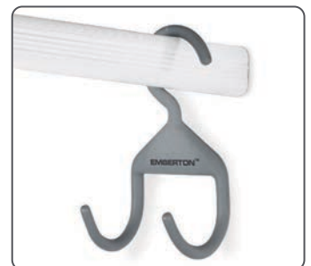
Available as OPEN RAIL HOOK EH50556