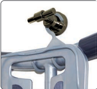
STORES BOARDS ON WALL HOOKS