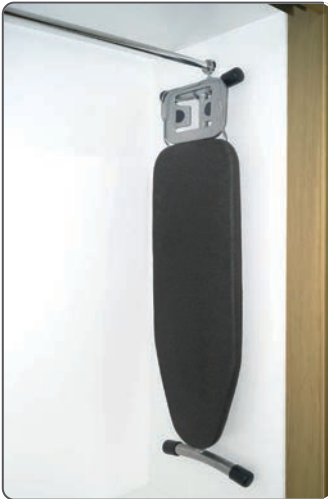
NEAT & TIDY STORAGE