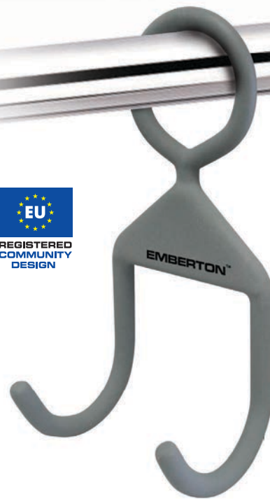
SECURITY RAIL LOOP EH50566