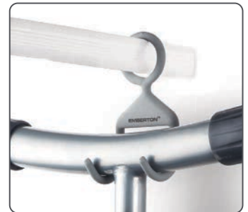
SECURE & SAFE TO PREVENT FALLING Patented Design